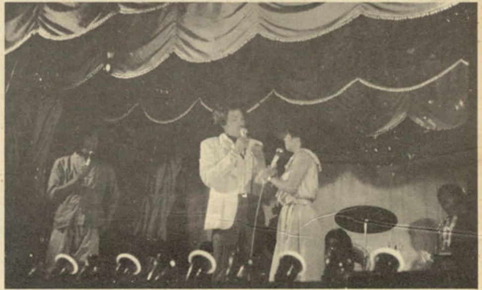
Ko-Tai In Progress

This is however not so to the lower working-class youths. For them, the ko-tai has become an important form of entertainment. Its combination of popular songs, slapstick and sketches which are closely related to contemporary social reality has great appeal.