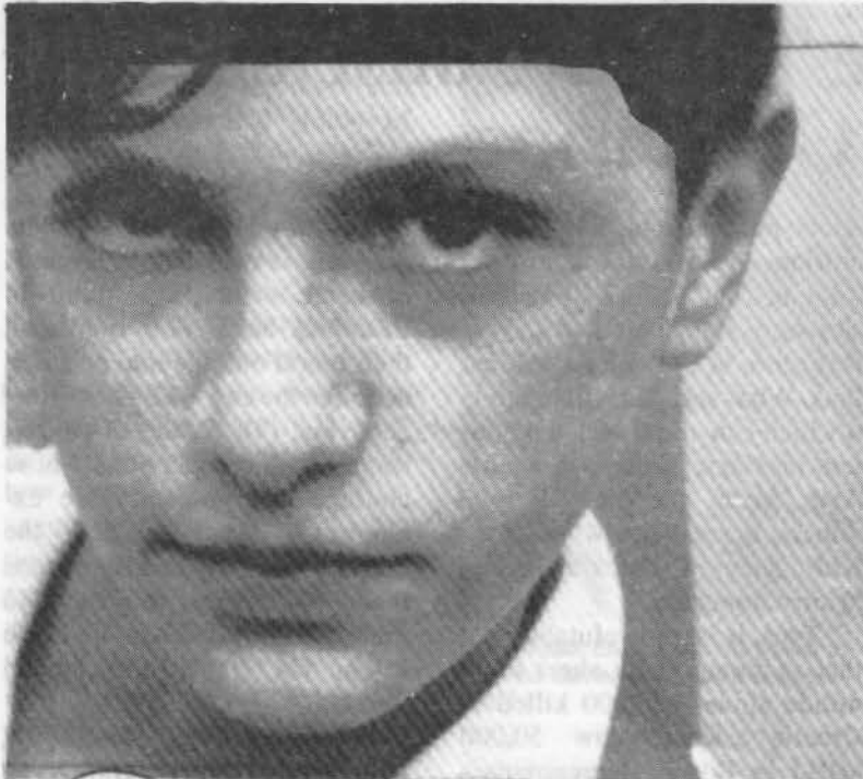
Displaced Bosnians have created a horrendous refugee problem unprecedented in modern times.

through the many vigilante groups it has established among the Serbs of Bosnia which is the main culprit behind the slaughter. It has been estimated that about 6,000 helpless, defenceless Bosnians have been killed since the state declared its independence in a referendum on 1 March 1992. More than a million Bosnians have been forced to flee their homeland - thus creating one of the most horrendous refugee problems in modern history.