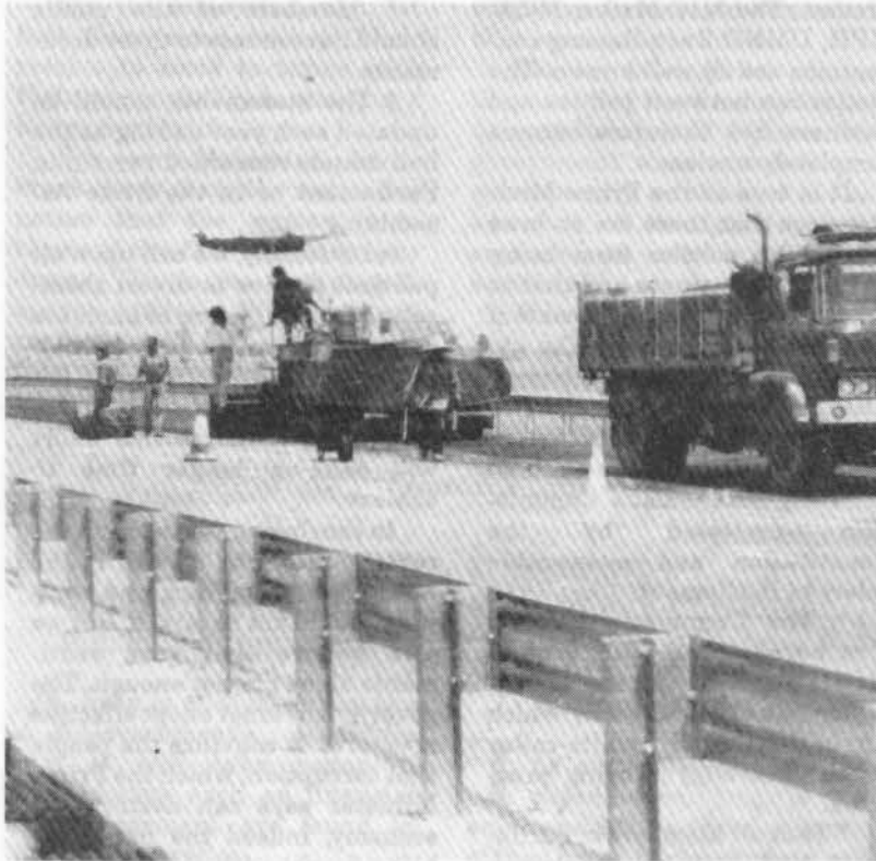
The Jitra-Alor Setar Highway: Were the Kedah stretches given priority attention because they are in the PM's home state?