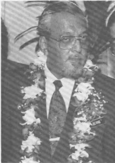
Elyas Omar: Symbol of power is a sleek Volvo?

T he controversial issue of 22 Volvo cars being purchased by Tan Sri Elyas Omar's Kuala Lumpur City Hall and the subsequent resignation of the mayor himself is in one sense a sad commentary of the curious and seemingly incurable obsession that many high government officials in the