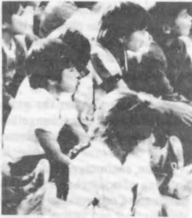
In Thailand, 800,000 of its citizens below age 16 cater to the needs of the tourist in search of exotic flesh.

environment, Malaysia openly acknowledges that the coastal waters of Penang and Langkawi (two of Malaysia's premier tourist destinations) had intolerably high levels of faecal coliform. "Pantai Merdeka, Tanjung Lembang and Pulau Langkawi in Kedah and Pantai Tempoyak and Pantai Gertak Sanggul in Penang had high levels of faecal coliform according to an Environment Quality Report of the Department of Environment. The Report said the coastal waters off Penang ranged highest in terms of faecal contamination followed by Selangor and Sarawak. Faecal coliform is used as an indicator for human and animal waste." The Star (14.2.90).