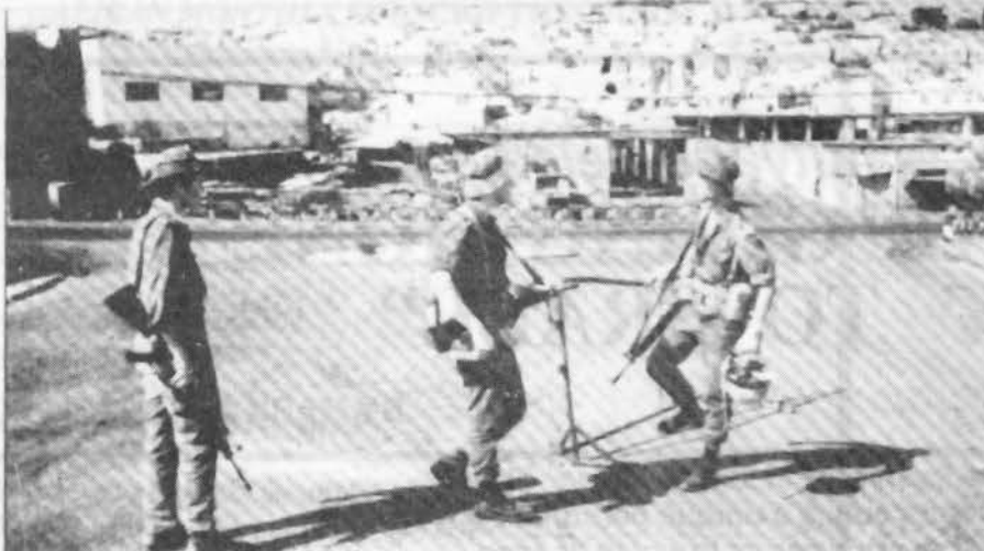
Israeli soldiers prevent the building of a mosque in Gaza: "I think it is our duty to call upon the United States to stop giving money to Israel."

Peled: Yes, right. They are allies, but that doesn't interfere with the basic attitude, which is, "OK, let's cooperate in keeping the conflict unresolved."