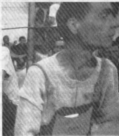
Europe faces a challenge to its human rights stand even as atrocities are played out in Bosnia.

Now is the time to prove that Europe's word is Europe's deed. Sarajevo is the place where the sincerity - or the hypocrisy - of all those lofty ideals, of all those sublime values, which Western civilization claims to represent