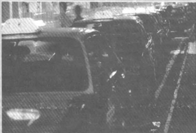
Increased toll rates smack of sheer incompetence and gross misjudgement on the part of PLUS.