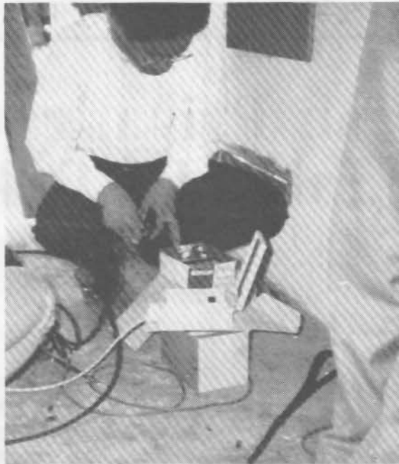
Providing a basic amenity like electricity is the government's social responsibility.

The government then becomes anxious to ensure that its remaining shares in the privatized body further increases in value. It gradually loses its sense of social responsibility. The overriding goal of the revamped privatized monopoly becomes profits, profits and more profits.