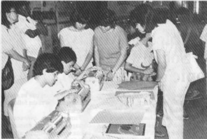
With education, the disabled became aware of their rights.

and service provisions. Because disability was viewed from a medical perspective, disabled persons were looked upon as recipients of the services and the providers of these services did not prepare nor take into account the need of the disabled to be involved in the decision making process. Consequently, the sixties saw the emergence of disabled people's movements which challenged the traditional approach to welfare provisions that isolated their participation.