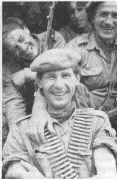
Serb militia: Europe has the power to stop the carnage, but has it enough will?

Six, the urgent need to demonstrate to the Muslims of Europe and the world, through Bosnia-Herzegovina, that Europe is capable of justice is underscored by a certain phenomenon associated with European history. For more than 1,200 years, the most influential and authoritative sections of European society, have displayed tremendous antagonism towards Islam and the Muslims. As the scholar-diplomat Erskine B. Childers puts it in a recent essay, "the Western 'view' of Islam and the Arabs in the late twentieth century still consists of little more than fear, antagonism, stereotypes and deep prejudice." If, right from the outset, Europe and the West had adopted a prin-