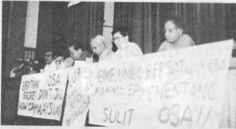
The OSA is inclined to creating a culture of rumour-mongering.

safeguard exists against over-zealousness in classifying any particular information as "Secret".