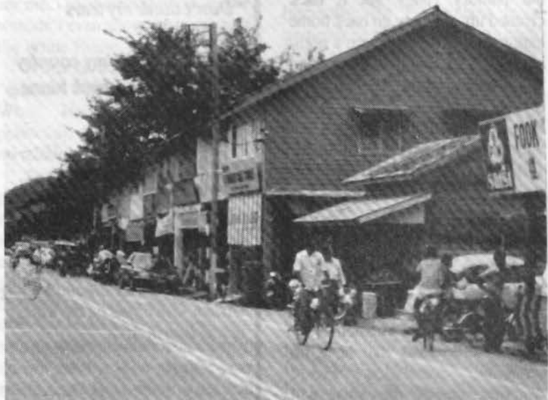
Kuah, Langkawi poised for massive development: What tourism wants, tourism gets.

Article 12 and 13 grandly proclaim that social progress and development shall among other things aim at (i) The elimination of all forms of foreign economic exploitation, particularly that practised by international monopolies, in order to enable the people of every country to enjoy in full the benefits of their national resources; (ii) The establishment of a harmonious balance between scientific, technological and material progress