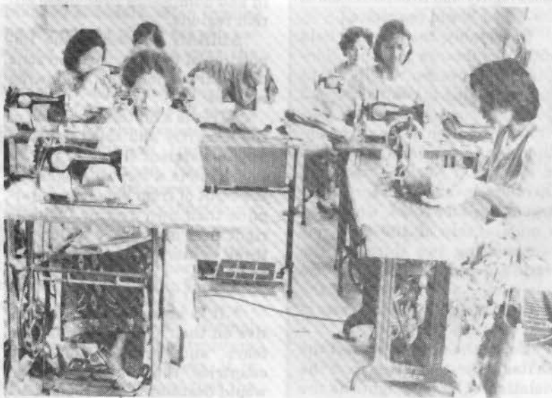
Malaysian women engaged in a successful self-help programme: Women's role in nation-building is given due recognition by the government this year.

It is encouraging to note that there has been an increase in women's participation in the workforce: in the fields of agriculture, industry and services. There has also been an increase in the number of female